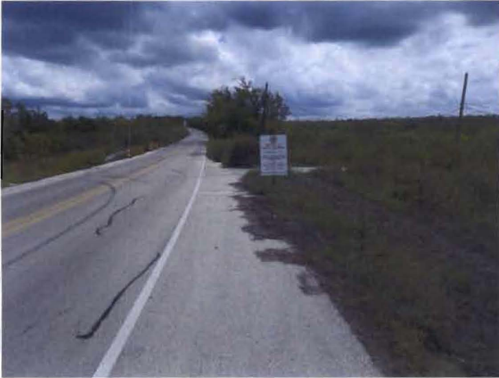
Public Notice sign posted on Westbound Moore Road just west of SH130.