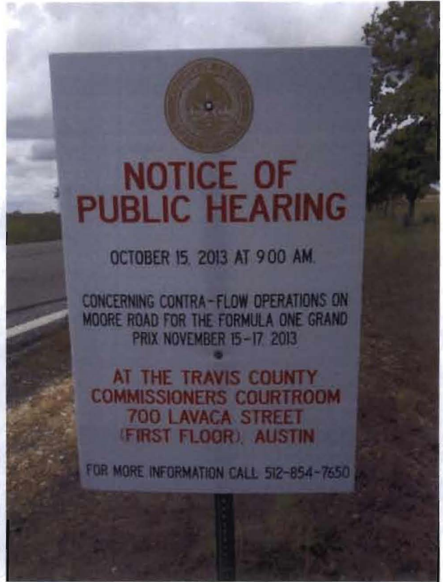
Public Notice sign posted on Eastbound Moore Road just east of Burkland Farms Road.