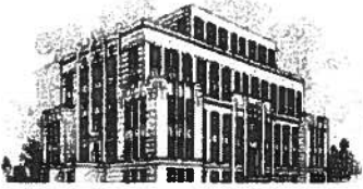
Travis County Courthouse, Austin, Texas