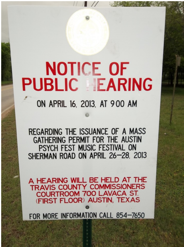
Public Notice signs for Pysch Fest Music Festival installed on 4/4/13