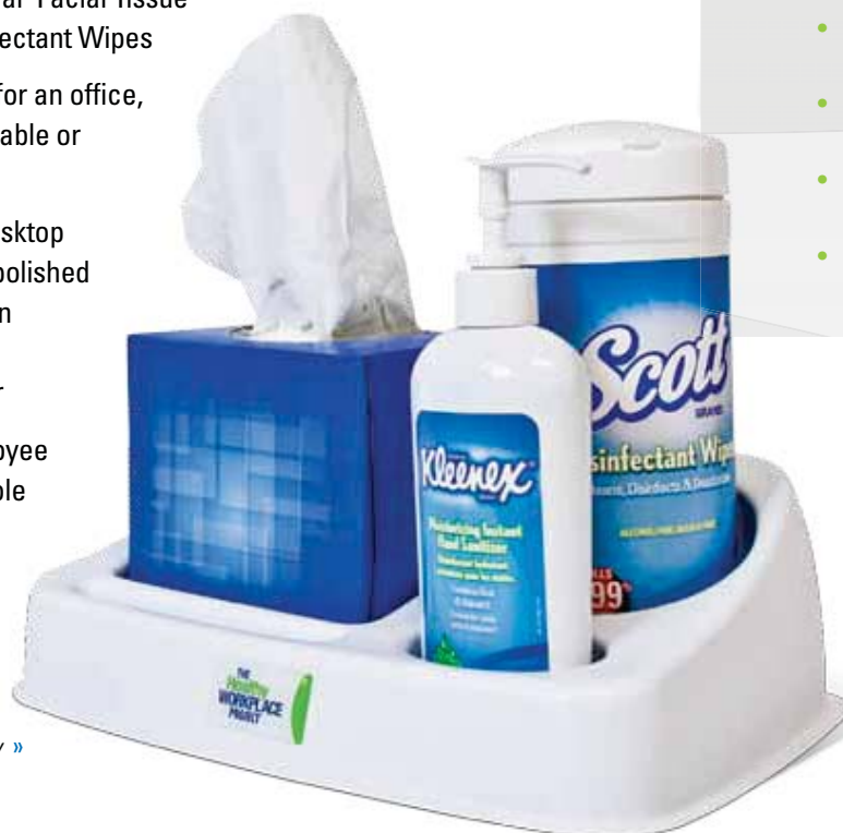
Standard Desk Caddy »