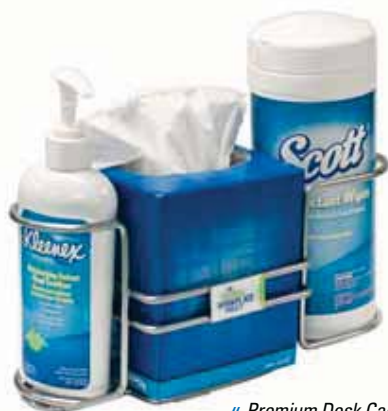
« Premium Desk Caddy