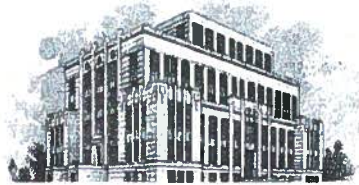
Travis County Courthouse, Austin, Texas