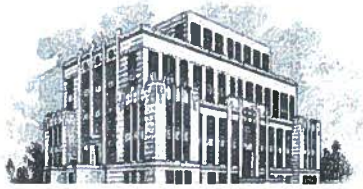
Travis County Courthouse, Austin, Texas